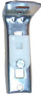
756 JAMB FLOOR BRACKET