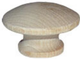
703 NATURAL WOOD KNOB 1 1/2" DIAMETER