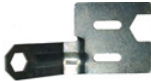
704 ALIGNER / WRENCH